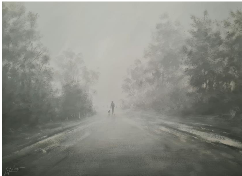
Paseo Acrylic on wood 75 x 100 cm