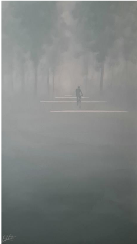
Morning Walk XV