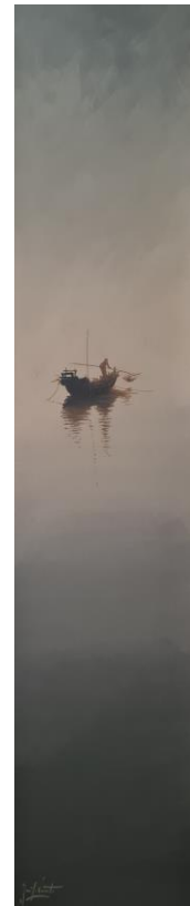
Pesca XIII Acrylic on wood 122 x 24 cm