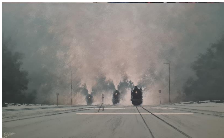
Old Rail VI Acrylic on wood 60 x 100 cm