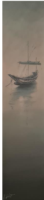
Boat XVI Acrylic on wood 100 x 22 cm