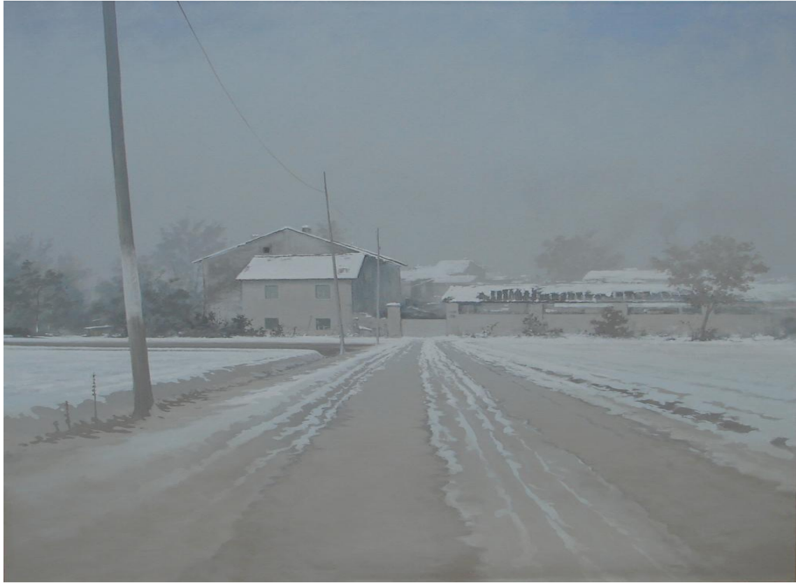
Winter Day Acrylic on wood 130 x 170 cm