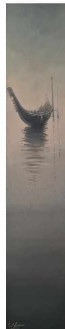
Veneciano Acrylic on wood 100 x 20 cm