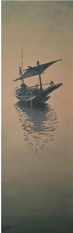
Boat XXI Acrylic on wood 122 x 40 cm