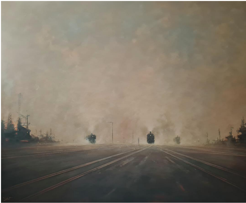
Old Railway III