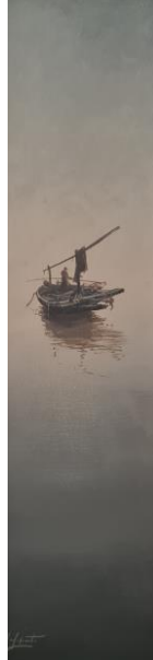
Pesca XIV Acrylic on wood 80 x 18 cm