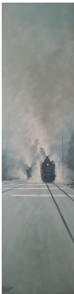
Old Rail IV Acrylic on wood 150 x 39 cm