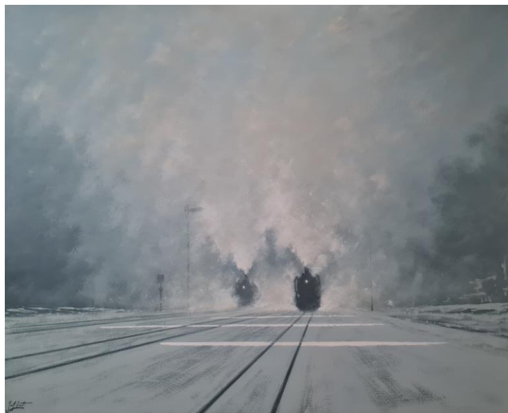
Old Rail III