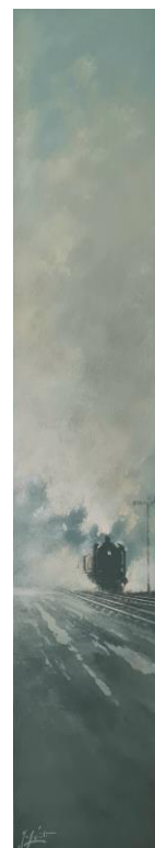
Old Rail V Acrylic on wood 110 x 20 cm