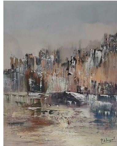
En el rio IV Acrylic on wood 53 x 45 cm