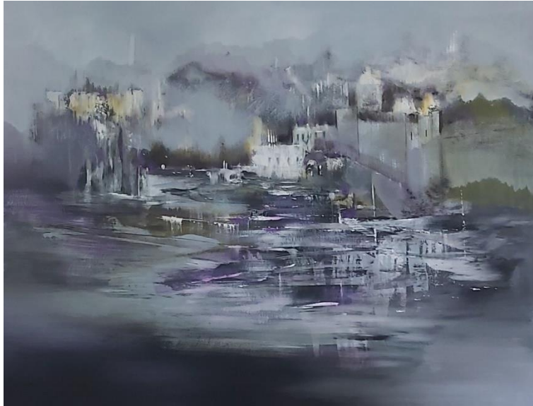
Paisaje en gris