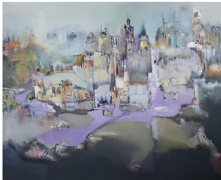
Metamorfosis de Un paisaje acrílico