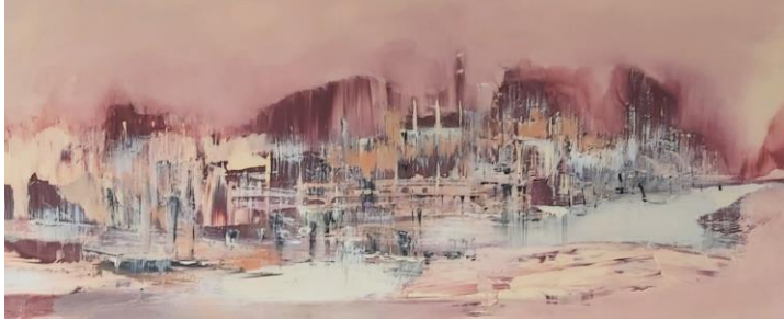
Cae la tarde Acrylic on wood 49 x 112 cm